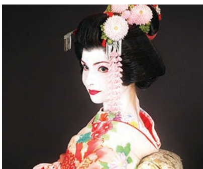
Exotic experience of Maiko girl