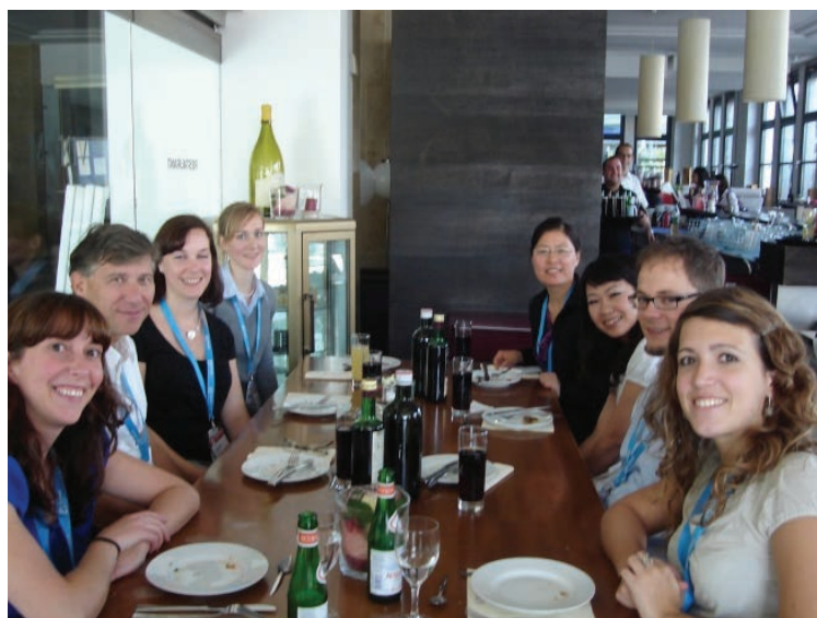
YS lunch at IATDMCT 2011, Stuttgart