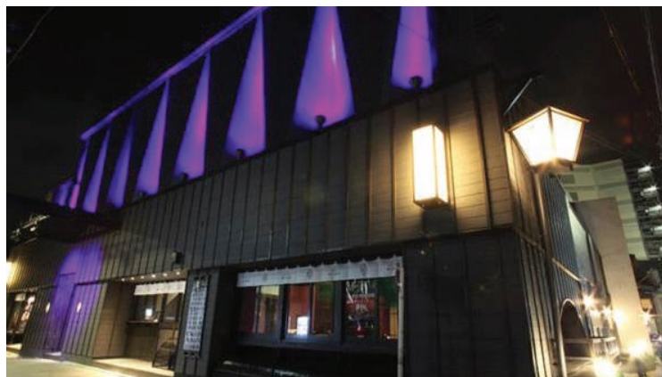
The "KYOTO, NINJA", the venue of YS night out

Notice: Registration is needed to attend the YS night out, and we offer 3,000 JPY per person as participation fee. Please visit the registration site ( https://goo.gl/forms/wu8wmZpOfdqBaXaq1 ) for details